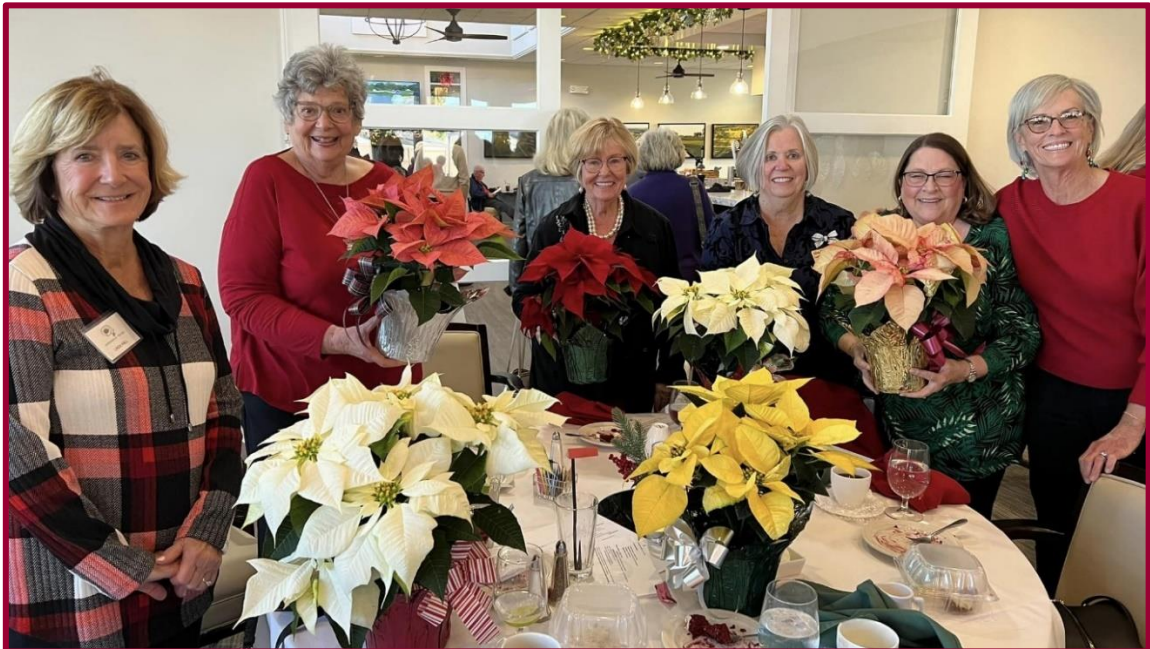
Annual Holiday Luncheon December 2023