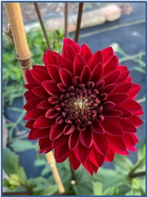
Spectrum Farms Dahlias