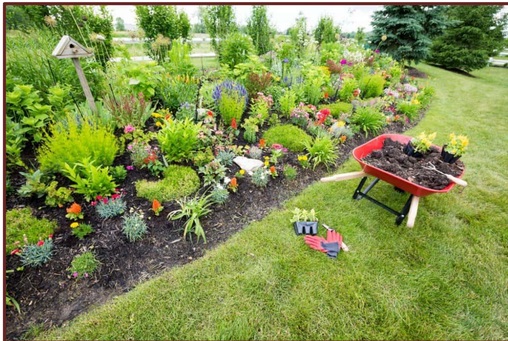
Preparing Your Garden for Spring