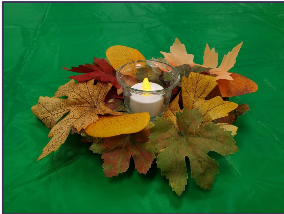
Table Arrangements ~ November 2023 Meeting