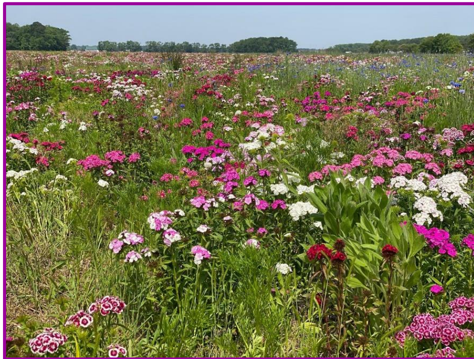
Story Hill Farm