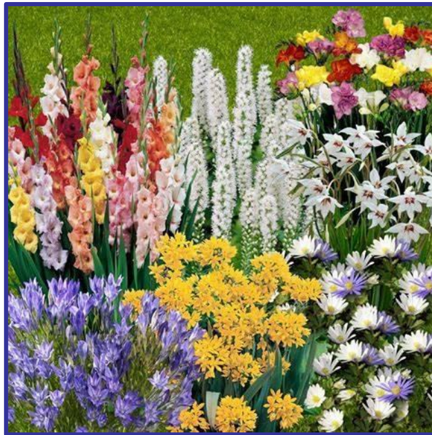
Summer Flowering Bulbs