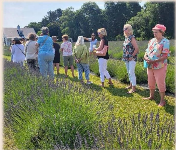
GBTS Programs 2023-2024 ~ Speakers, Programs, Members