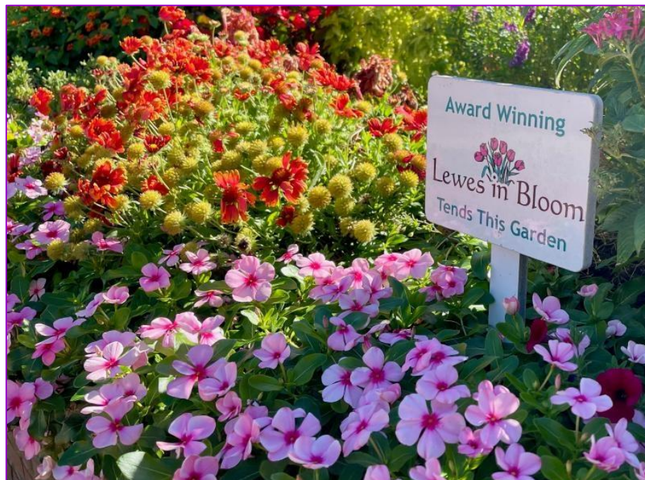
Lewes in Bloom